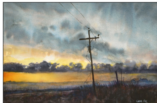
Connected , Cheri Fry