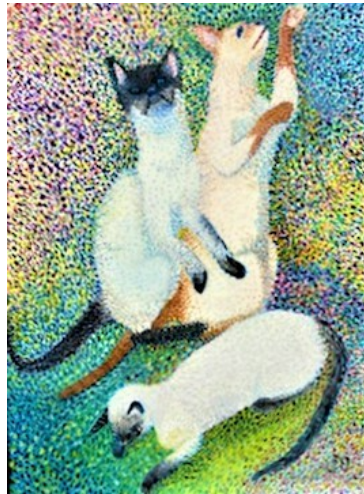
Top left: Gertie and Me Top right: Fishin'