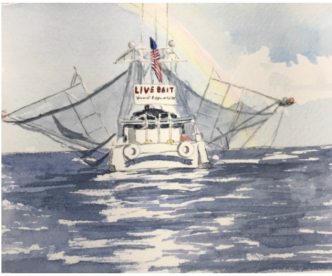
Near Dulac, LA # 125