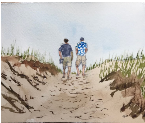
Above: New Jersey #117;