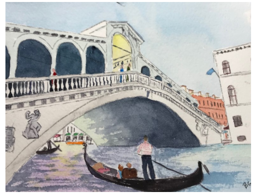
Rialto Bridge, Venice #171