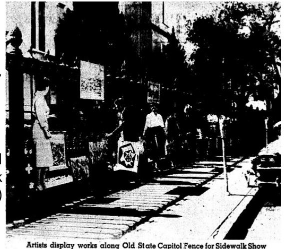
Artists display work along the Old State Capitol fence for a sidewalk show. (1960)