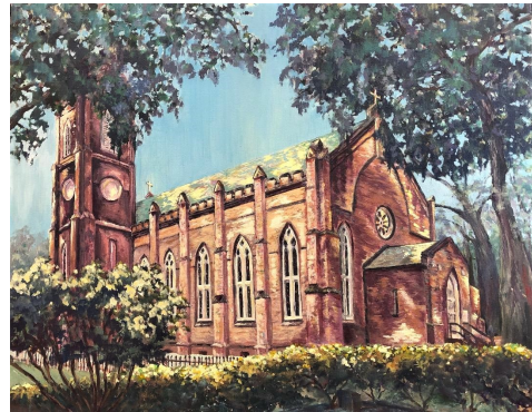
Grace Episcopal —Kay Wallace